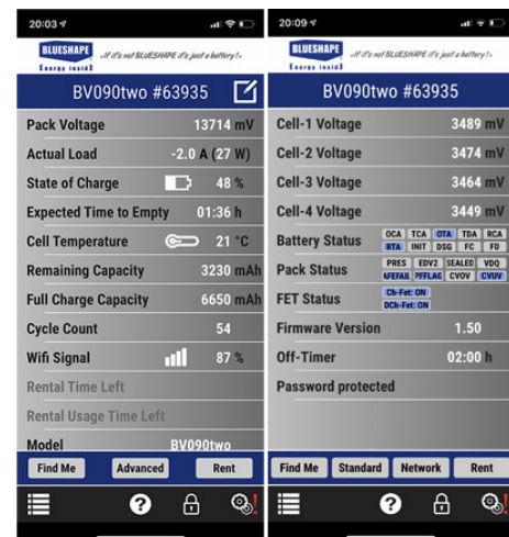
GRANITE Link App, main two pages