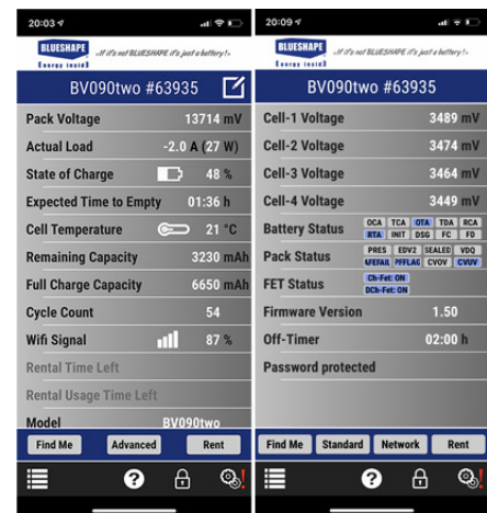
GRANITE Link App, main two pages

Contact BOLD Distribution, 615.431.2499 info@bolddistribution.us