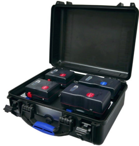
Batteries shown, not included