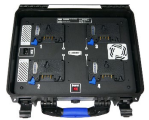
Top View of Charging Deck