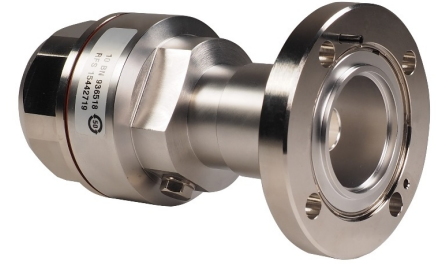
158EIA Connector for HCA158 Cable

External Document Links Installation Instruction