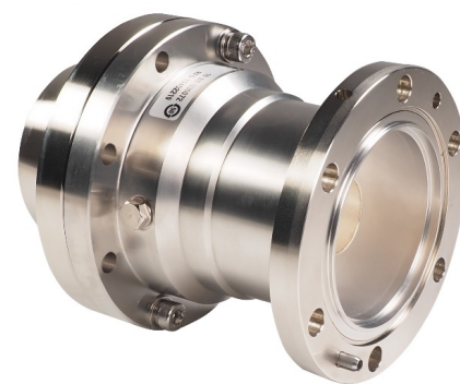
318EIA Connector for HCA300 Cable