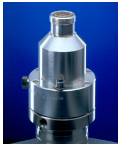
Connector 7-16 socket CAF