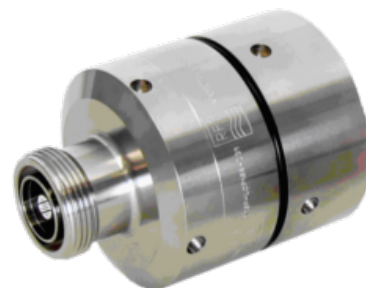
OMNI FIT™ Premium Connectors