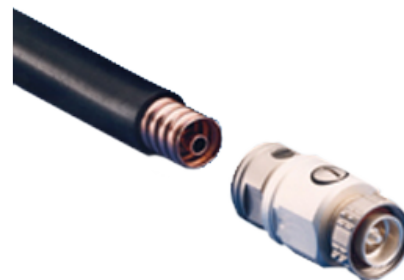
Connector 7-16 plug CAF