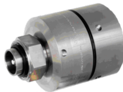
OMNI FIT™ Premium Connectors