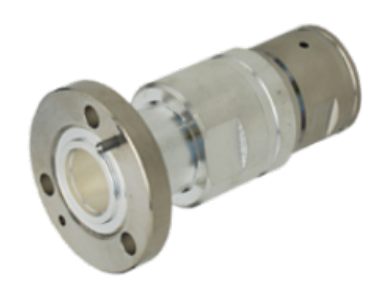
Connector EIA 7/8"