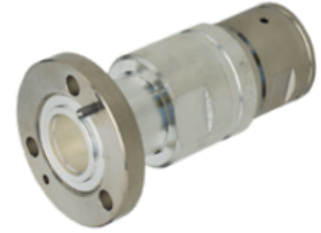
78EIA Connector for HCA78 Cable