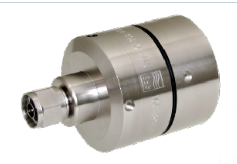
OMNI FIT™ Premium Connectors