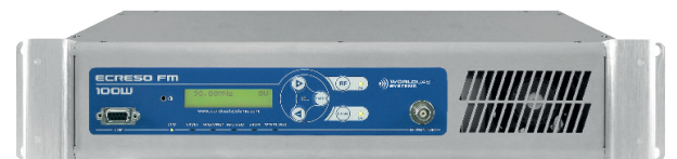
Ecreso FM 100W