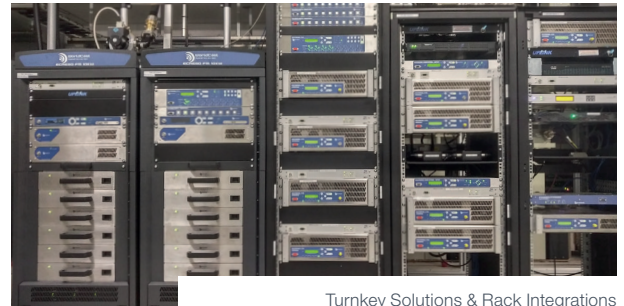
Turnkey Solutions & Rack Integrations