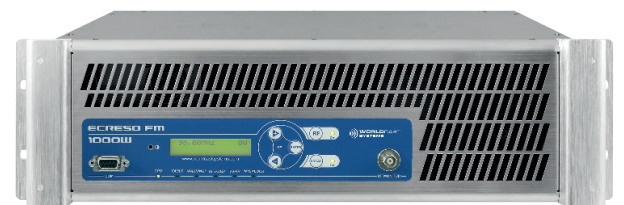
Ecreso FM 1000W