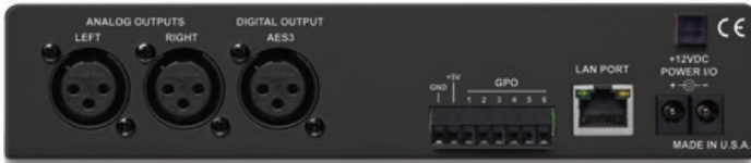
611 REAR I/O