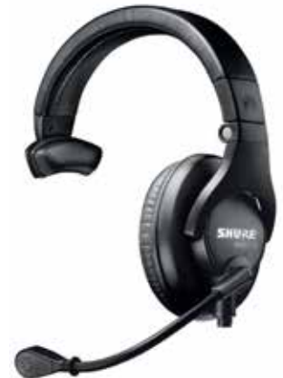
BRH441M Single-Sided Broadcast Headset