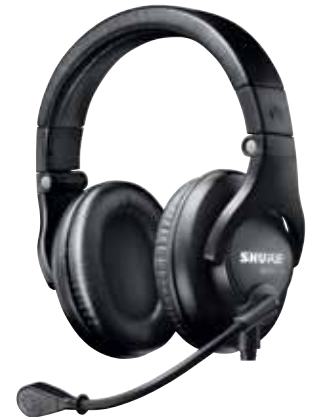
BRH440M Dual Sided Broadcast Headset