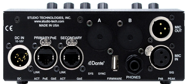
Figure 1. Model 232 Announcer's Console front and back views

The amount of flexibility provided in the Model 232 allows it to meet the needs of virtually all on-air announcer applications. And using the Studio Technologies' STcontroller software application makes "customizing" the operation of a Model 232 fast and simple. The unit's ability to handle both day-to-day and specialized situations makes it a unique product in the market. For example, the pushbutton switches and rotary encoders can be independently configured with multiple choices that range from simple to quite advanced. If a Model 232 cannot be configured to meet an application's goals, please contact Studio Technologies' technical support for an application review.